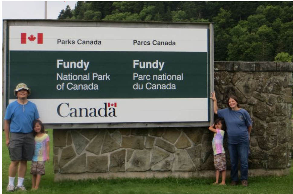
Photo 24: Fundy National Park sign, New Brunswick, Canada [Jul. 28]