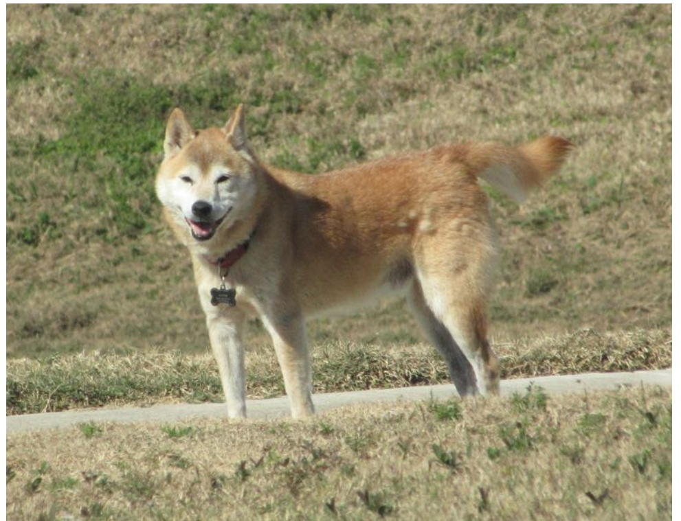
Photo 7: Hunter at the "Phone Eating Park" Friendswood, TX [Nov. 26]