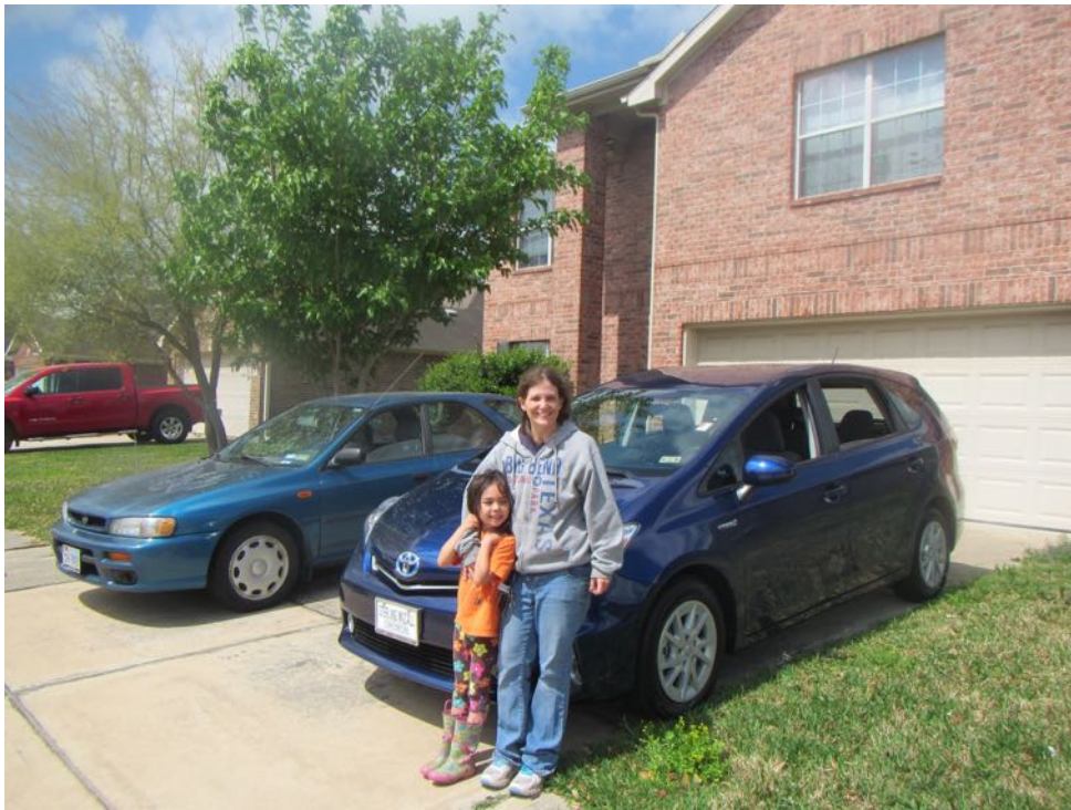
Photo 32: Our new 2014 Toyota Prius V 3, and 1997 Subaru Impreza [Mar. 31]