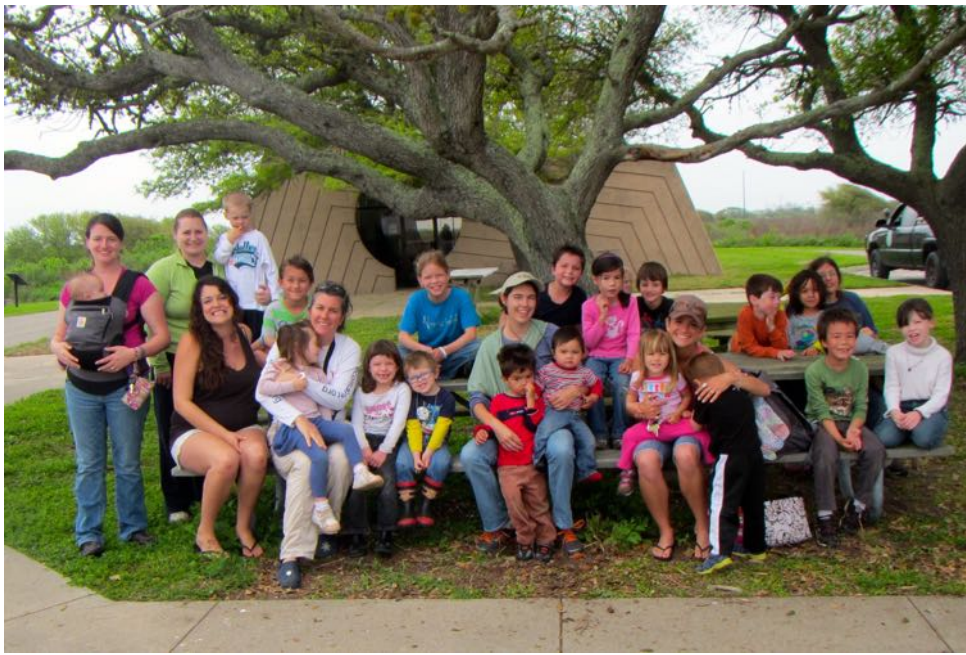
Photo 8: Galveston Homeschool Group at Galveston Island State Park [Apr. 1]