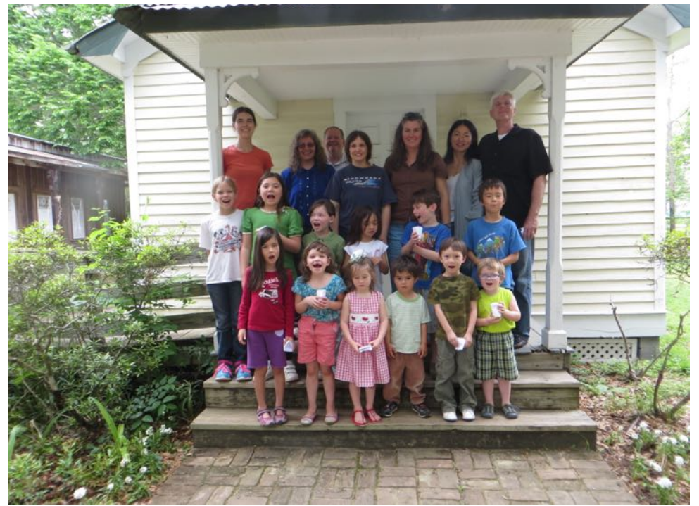
Photo 10: Homeschool group at the West Bay Common School Children's Museum, League City, TX [Apr 22]