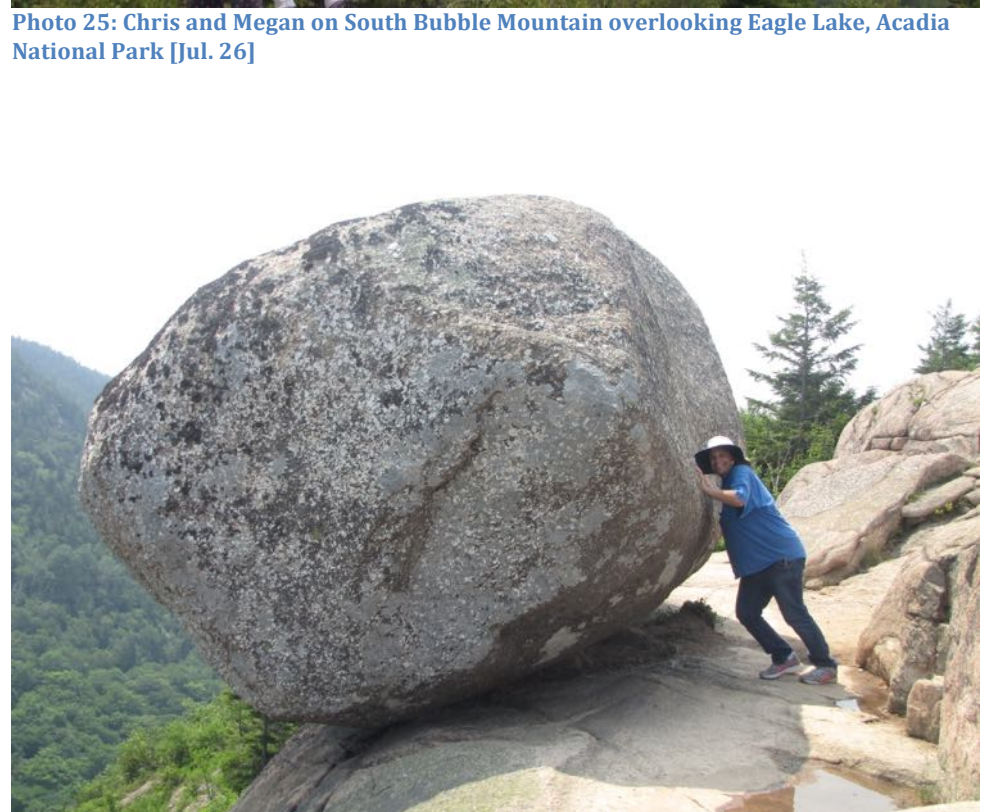
Photo 26: Julie pushing South Bubble Rock, Acadia National Park [Jul. 26]